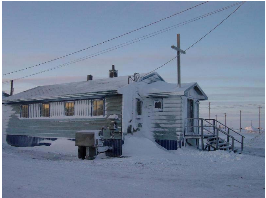
Kaktovik Presbyterian Church in Winter

Last Spring some of the members of the Chapel in the Mts. (Anaktuvuk Pass, AK) suggested that Kaktovik consider sharing a pastor with them. They admit that there is much to consider before any final decision can be made on this proposal. Efforts would be needed to be sure that the plan is God's way forward for leadership in these churches, or that the plan is feasible. However, both congregations are able to provide something less than half of pastor support package, and both have manses in which a pastor could live. The Anaktuvuk members suggested that the two churches consider providing what they can, and that they approach the presbytery about allowing this person to also serve as director of Project Y.E.S. in the presbytery. Taken together, all of this might be a supportable package.