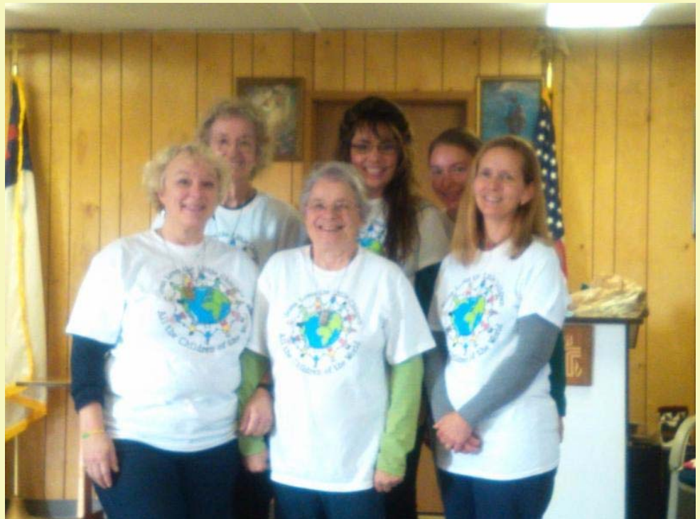
2015 VBS in Atkasuk including visitors from the lower 48 and Palmer/Wasilla